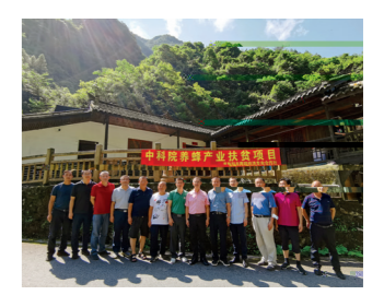
The Scientific and Technological