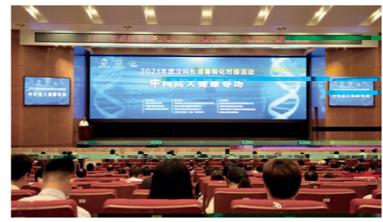
2021 The 2021 Wuhan Conference on the Scientific and

and the local government on scientific and technological innovation. It has been on a mission to promote the scientific and technological innovation cooperation between CAS and two provinces, Hubei Province and Hunan Province, and to serve the scientific and technological innovation of the institutes of CAS in Wuhan. It has indefatigably innovated, pragmatically and efficiently did a lot of work, vigorously promoted the social and economic high-quality development of the two provinces, and increased the influence and publicity of CAS in the local areas. Meanwhile, it has built a scientific and technological cooperation team with strong cohesion and fighting capacity.